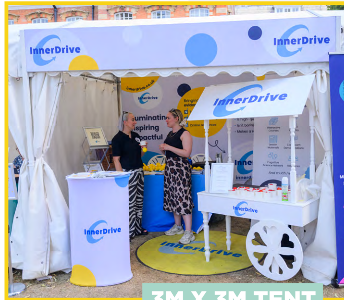
3M X 3M TENT

“I spent the day at the Festival of Education, and wow, what a of fresh air it was!” LinkedIn