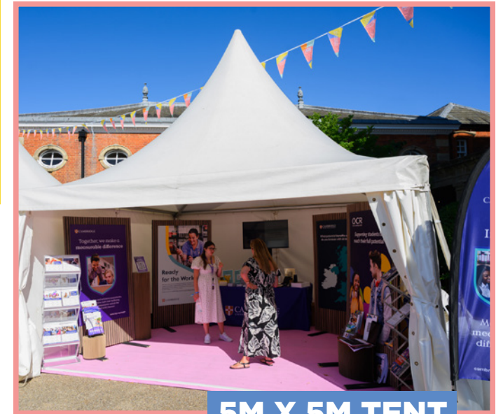
5M X 5M TENT