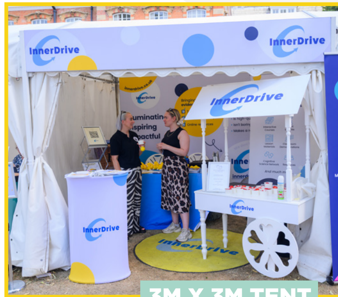
3M X 3M TENT